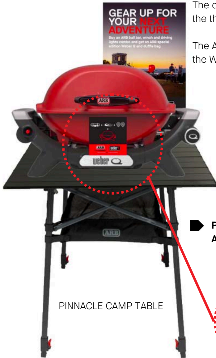
PINNACLE CAMP TABLE

The display Weber is to be set up on the the Pinnacle camp table.