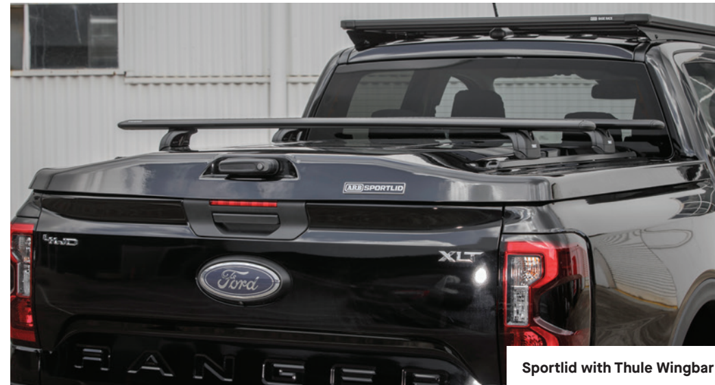
Sportlid with Thule Wingbar