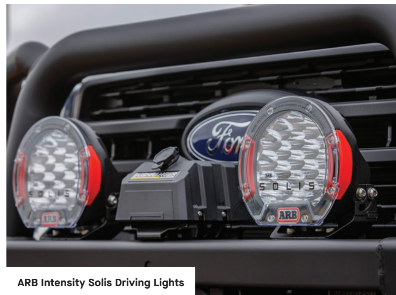
ARB Intensity Solis Driving Lights