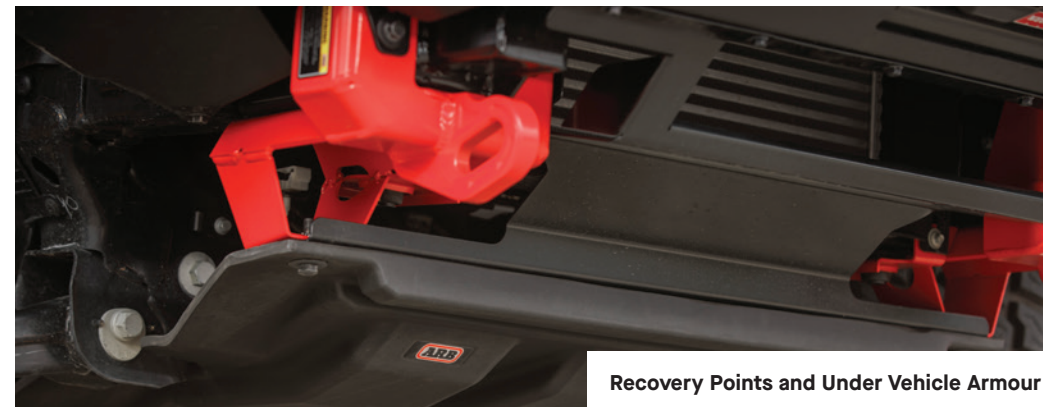
Recovery Points and Under Vehicle Armour