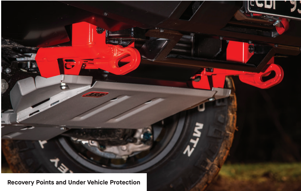
Recovery Points and Under Vehicle Protection