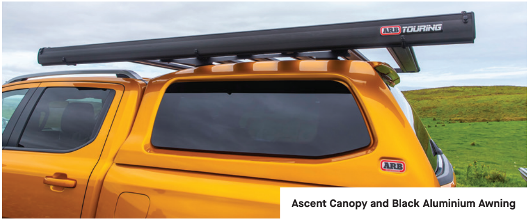
Ascent Canopy and Black Aluminium Awning