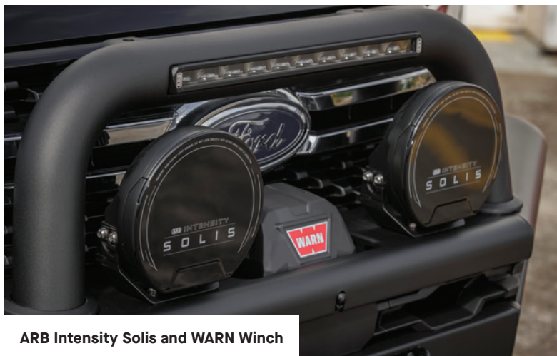
ARB Intensity Solis and WARN Winch