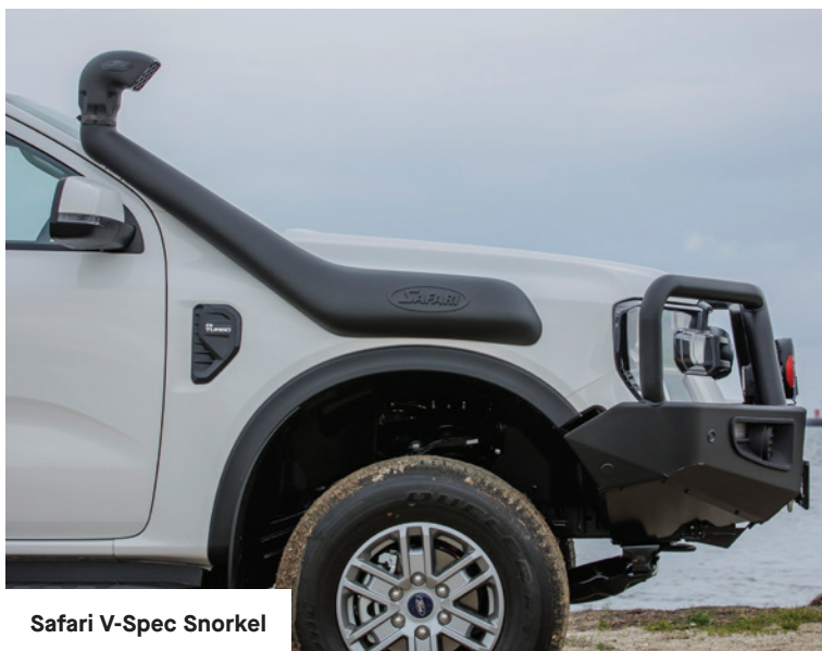
Safari V-Spec Snorkel