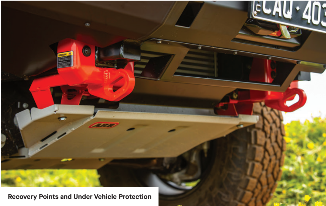
Recovery Points and Under Vehicle Protection