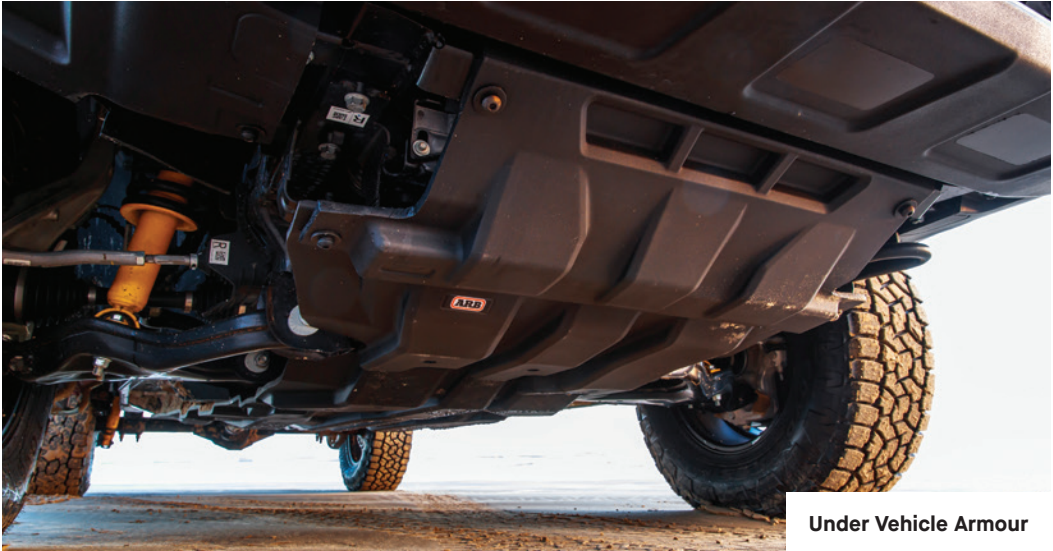
Under Vehicle Armour