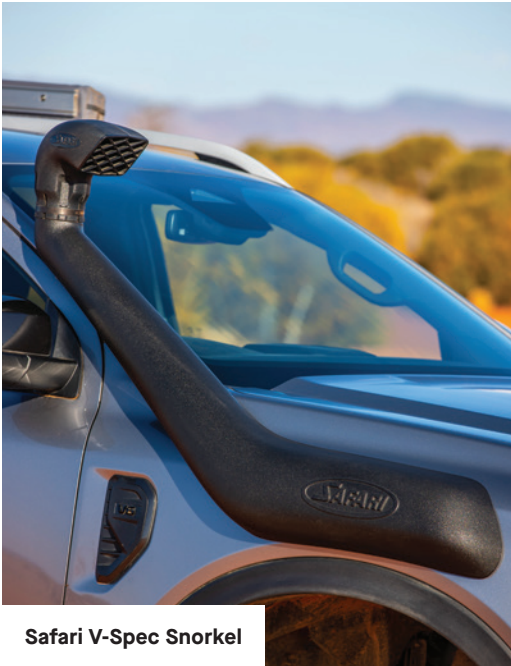
Safari V-Spec Snorkel