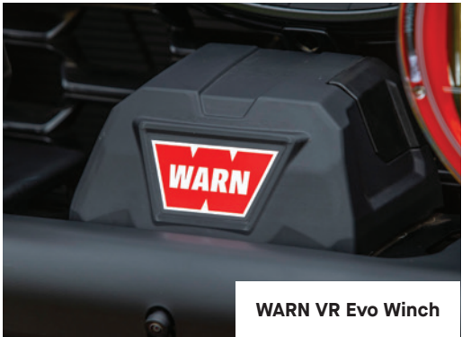
WARN VR Evo Winch