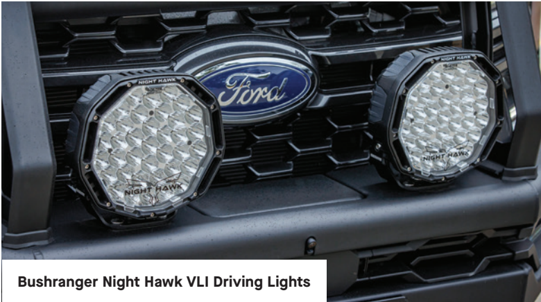
Bushranger Night Hawk VLI Driving Lights