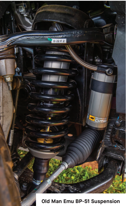
Old Man Emu BP-51 Suspension