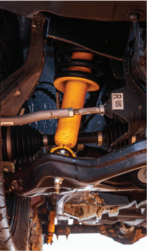
Old Man Emu Nitrocharger Sport Suspension