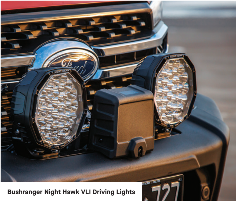
Bushranger Night Hawk VLI Driving Lights