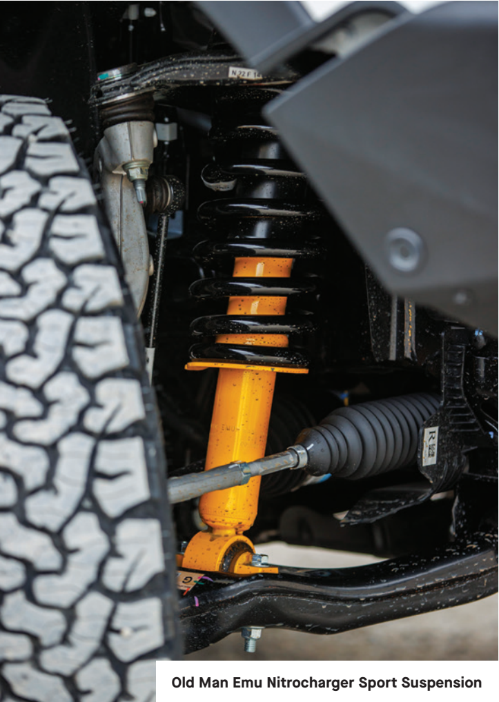
Old Man Emu Nitrocharger Sport Suspension