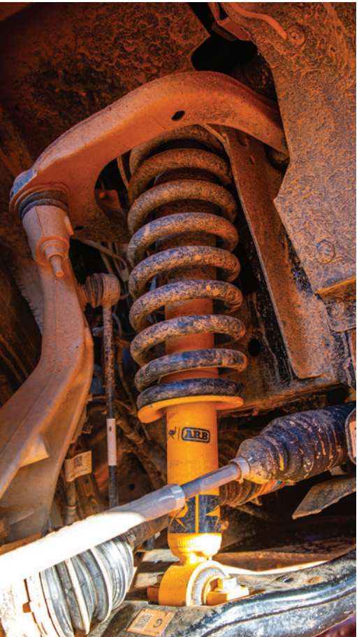
Old Man Emu Nitrocharger Sport Suspension