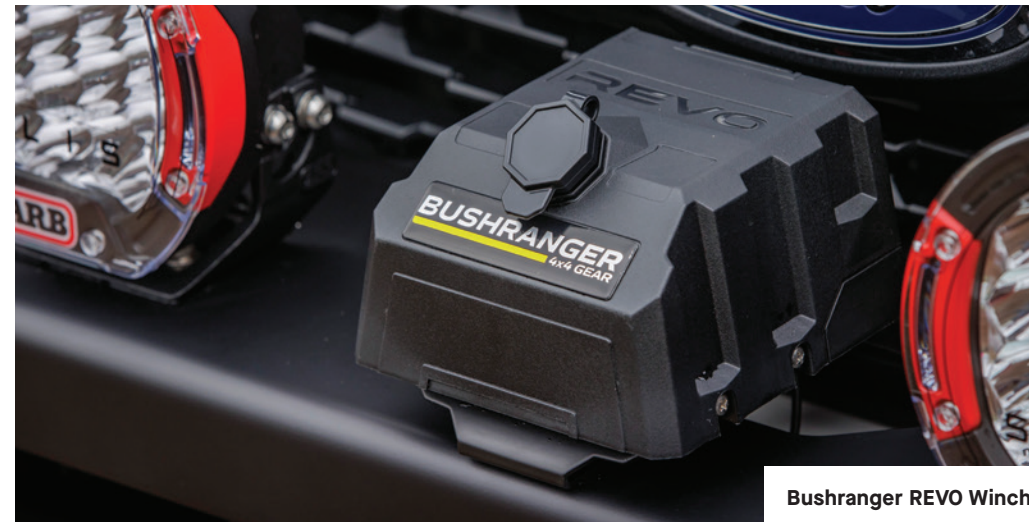
Bushranger REVO Winch