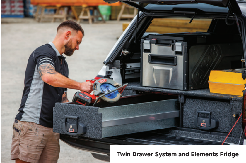
Twin Drawer System and Elements Fridge