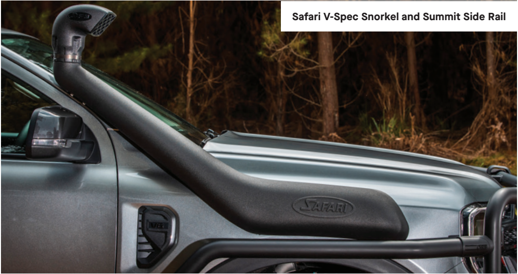
Safari V-Spec Snorkel and Summit Side Rail