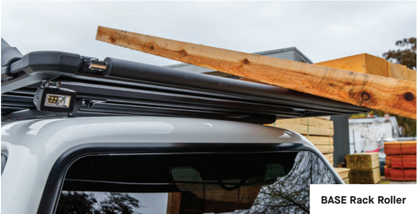
BASE Rack Roller