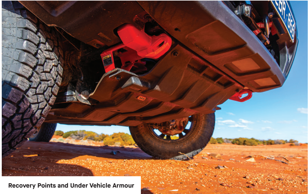
Recovery Points and Under Vehicle Armour