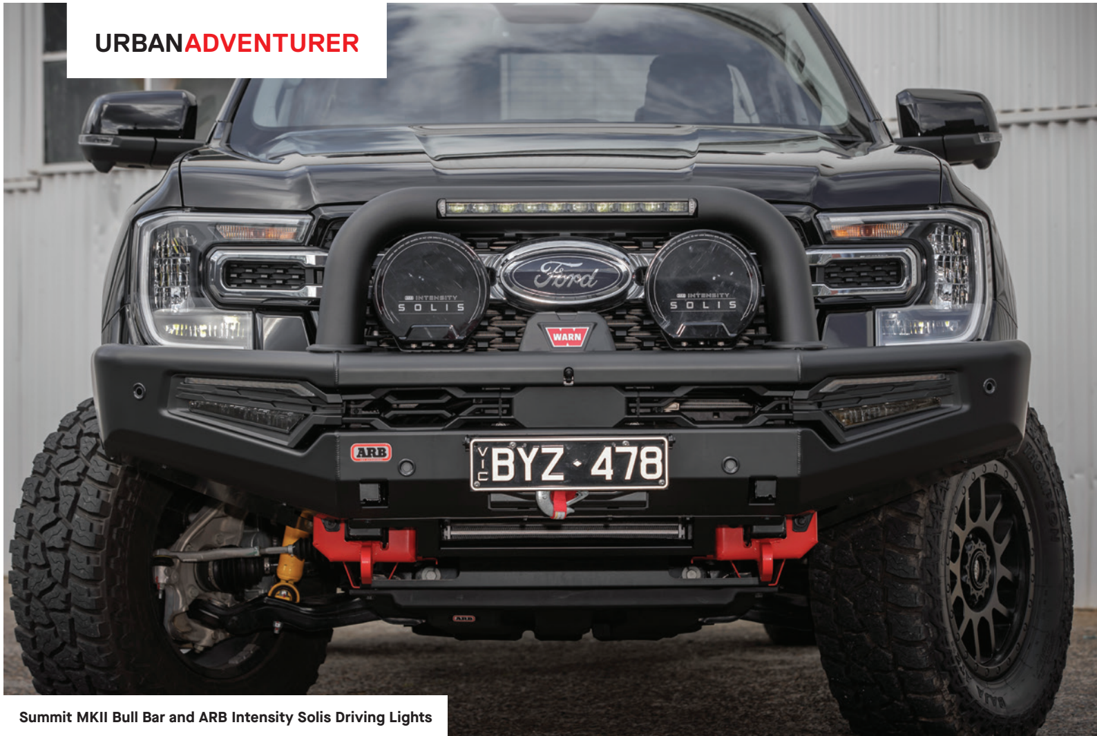
Summit MKII Bull Bar and ARB Intensity Solis Driving Lights