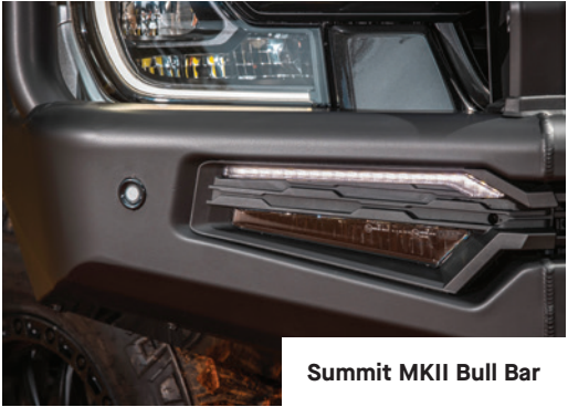
Summit MKII Bull Bar