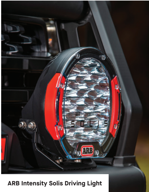
ARB Intensity Solis Driving Light