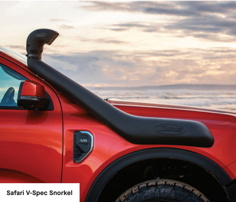
Safari V-Spec Snorkel