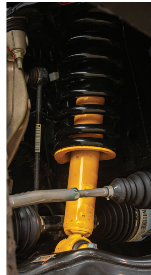
Old Man Emu Nitrocharger Sport Suspension