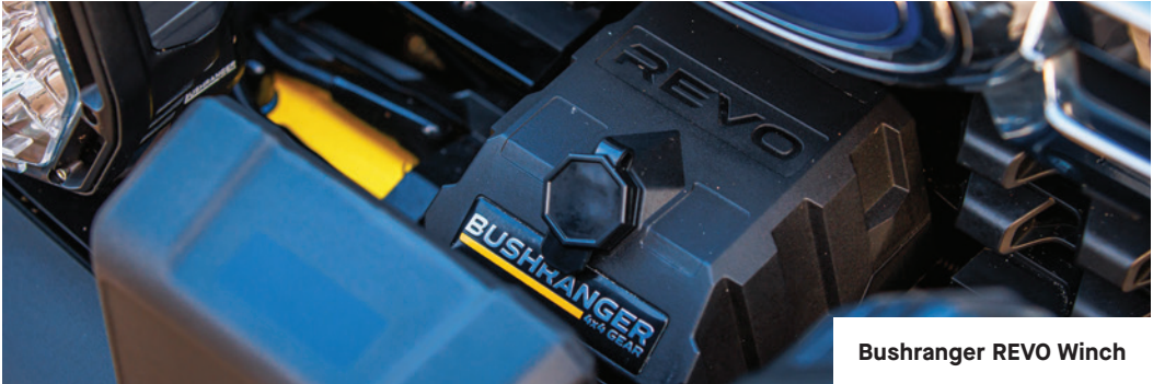
Bushranger REVO Winch