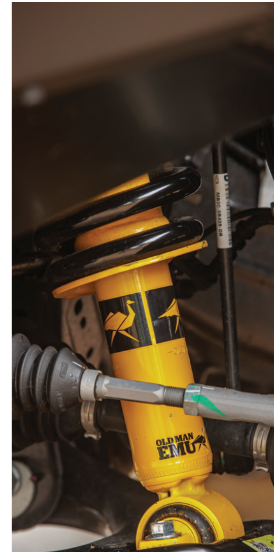
Old Man Emu Nitrocharger Sport Suspension