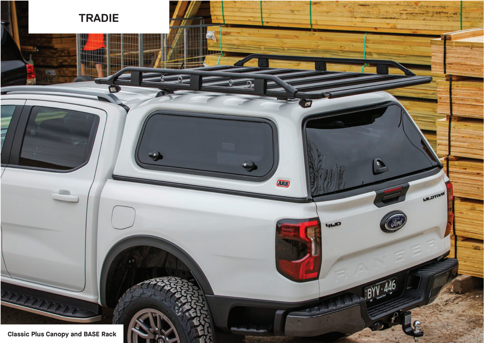
Classic Plus Canopy and BASE Rack