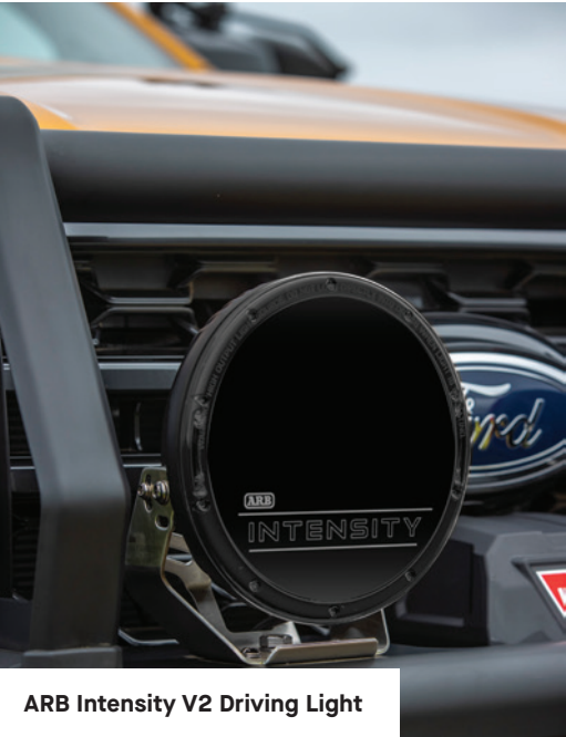
ARB Intensity V2 Driving Light