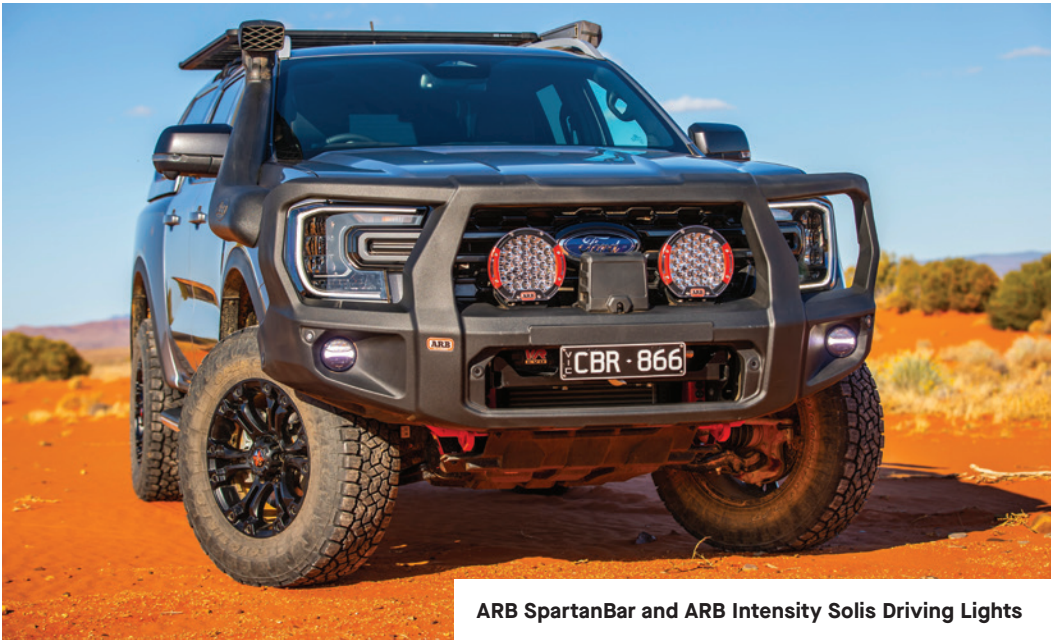
ARB SpartanBar and ARB Intensity Solis Driving Lights