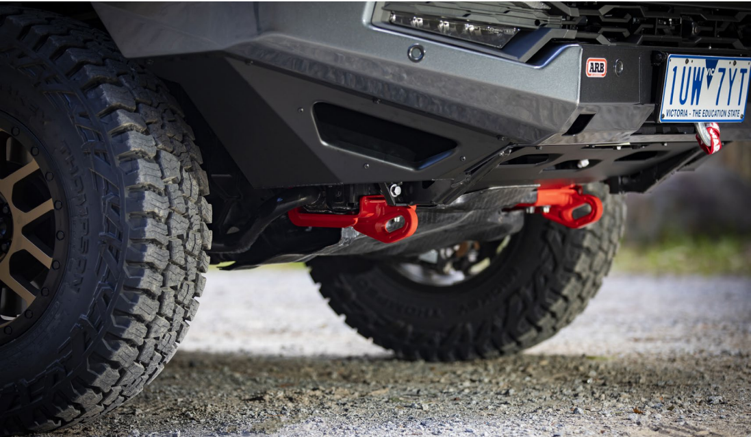
→ Available for Prado, HiLux, 70 Series and 300 Series (Forged Recovery Points as seen in image)

It is important to have strong, reliable recovery points when travelling off road. ARB has sought to set an industry benchmark for how recovery points are designed, tested and selected by 4WDers. Each vehicle-specific recovery point undergoes considerable research and design, and is rated for use with a 4.75-tonne rated bow shackle and an 8,000-kilogram snatch strap. Manufactured from steel plate, ARB's Recovery Points are rated for angled recovery and use vehicle-specific mounting systems to ensure the fitment does not affect airbag deployment or the crash pulse of the vehicle.