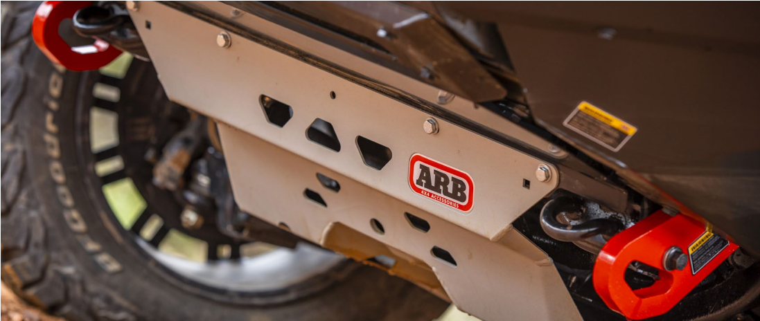
→ Available for HiLux, 300 Series and Prado