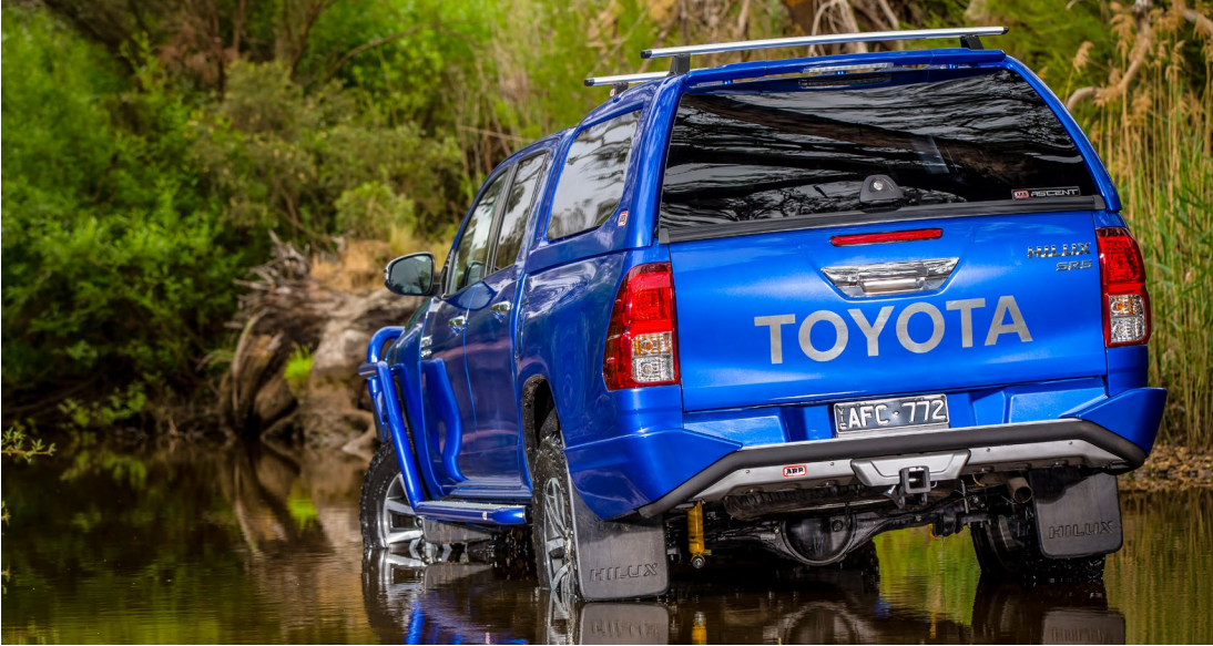
→ Available for HiLux

With press-forming used throughout for increased strength, the Summit Rear Step Tow Bar is ready for the most demanding off road use.