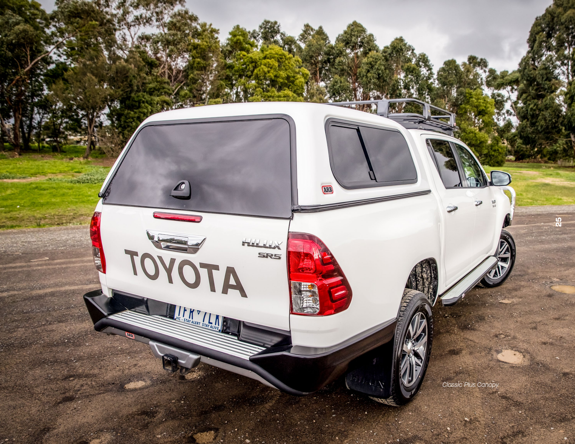
Classic Plus Canopy