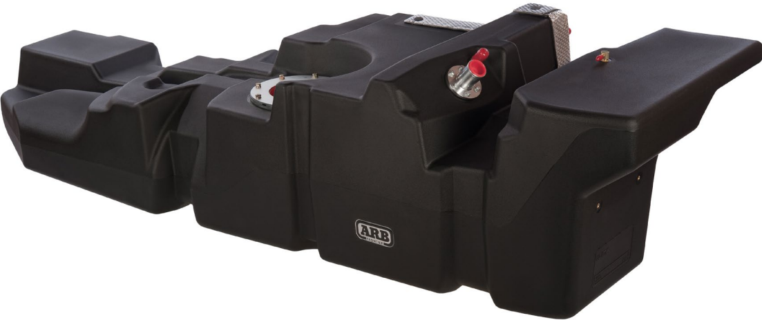
HiLux Frontier Tank shown