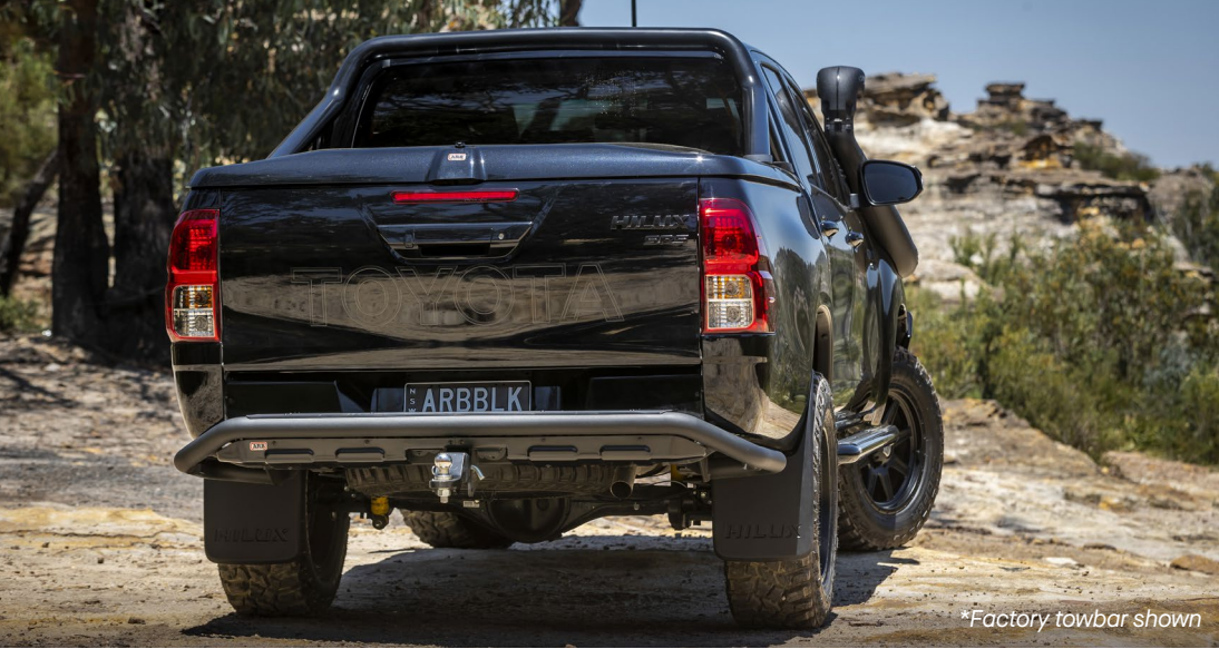
→ Available for HiLux

Featuring a 60.3-millimetre tube finished with a textured black powder coat, the Summit Raw has been designed to provide protection against the lower sections of the vehicle tub whilst retaining style cues from the Summit Rear Step Tow Bar range.