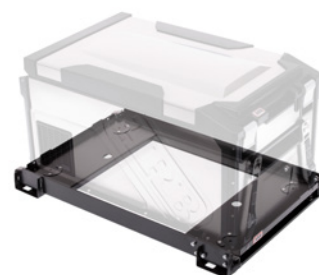
Fridge Slide Elements suits 60L