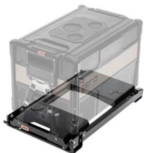
Fridge Slide ZERO suits 36L and 44L