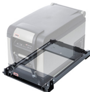
Fridge Roller Slide Classic SII suits 35L and 47L (80kg Rating)