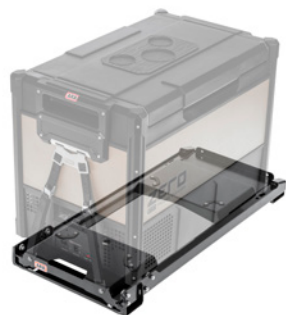
Fridge Slide ZERO suits 60L, 69L and 73L