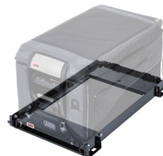
Fridge Roller Slide Classic SII suits 60L and 78L (120kg Rating)