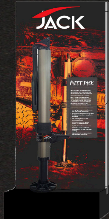
ARB Branded Stores, Shows + Stockists