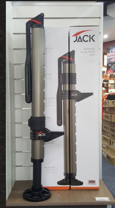
Gondola End Display