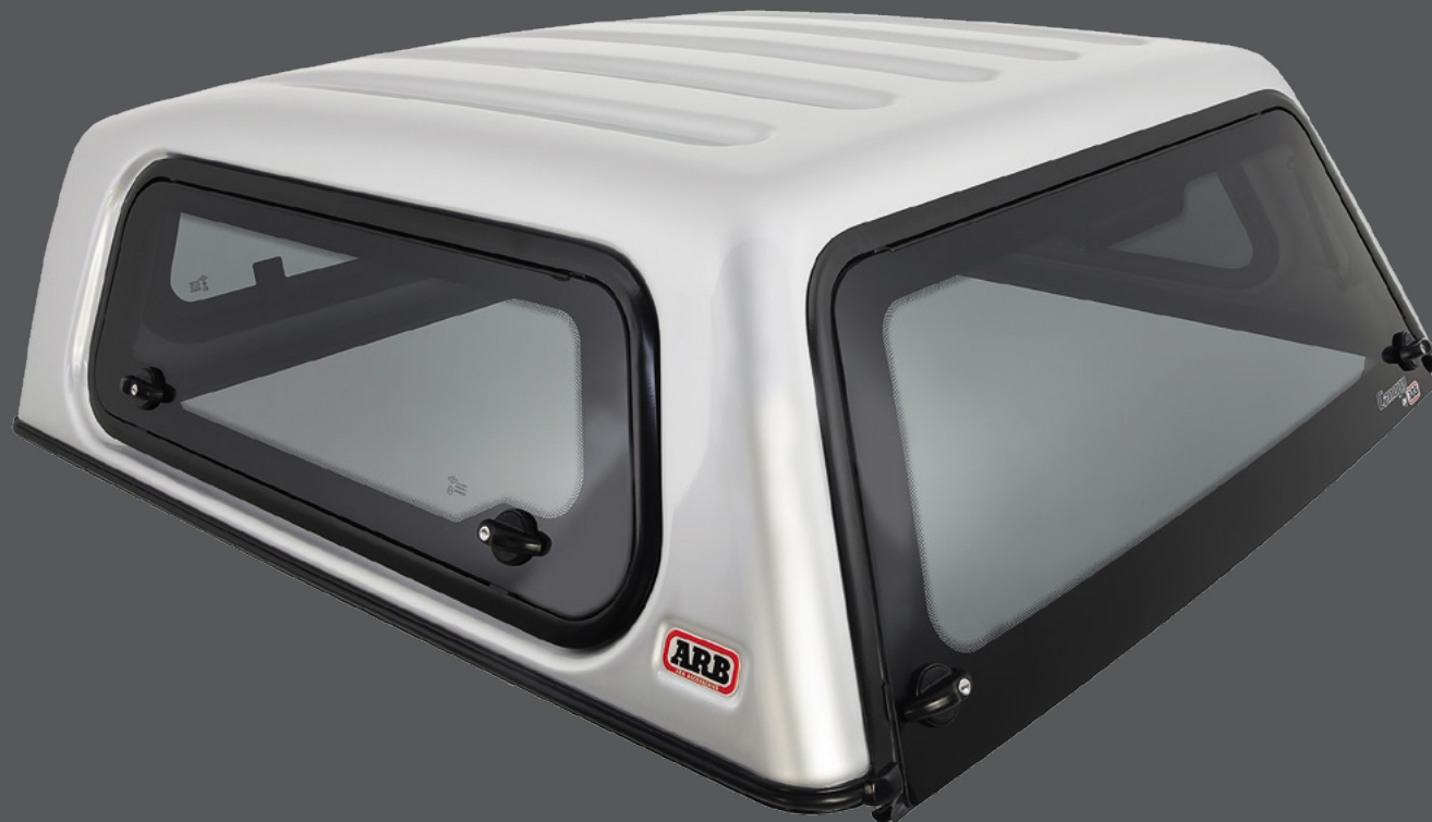
Classic canopy shown