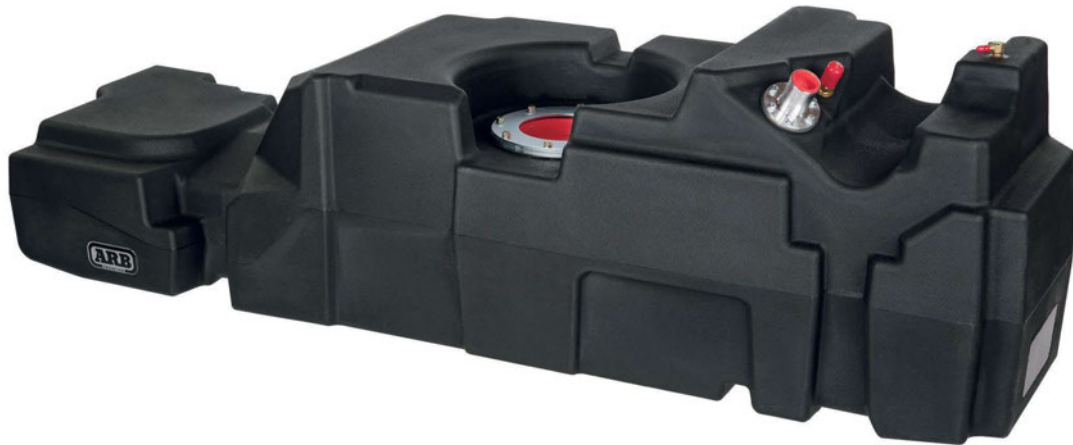
Ranger Frontier tank shown